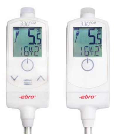
FOM 330-4 and FOM 330-1

In addition to the manual, the scope of delivery includes illustrated step-by-step-instructions, as well as a certificate of calibration for proof of the functionality of your device.