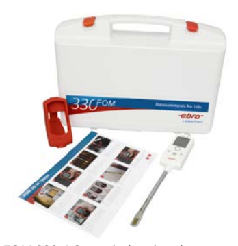
FOM 330-4-Set including hand protection and carrying case